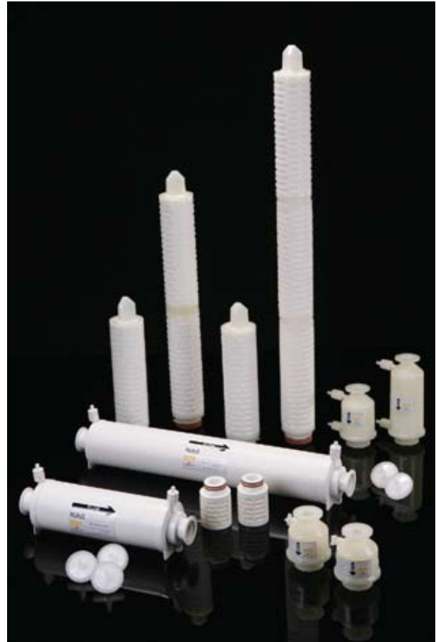
Note: TETPOR is a registered trademark of Parker domnick hunter